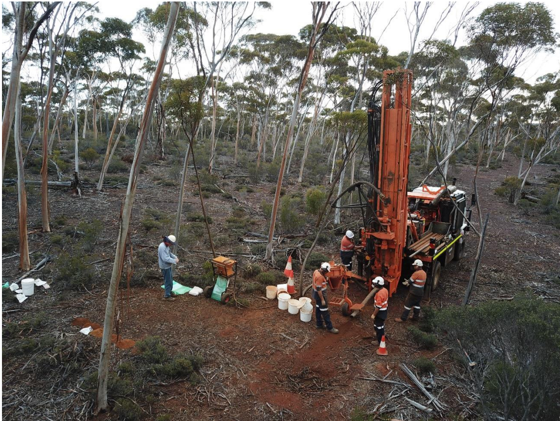
Figure 2 – Sample collection at Mt Thirsty, August 2018